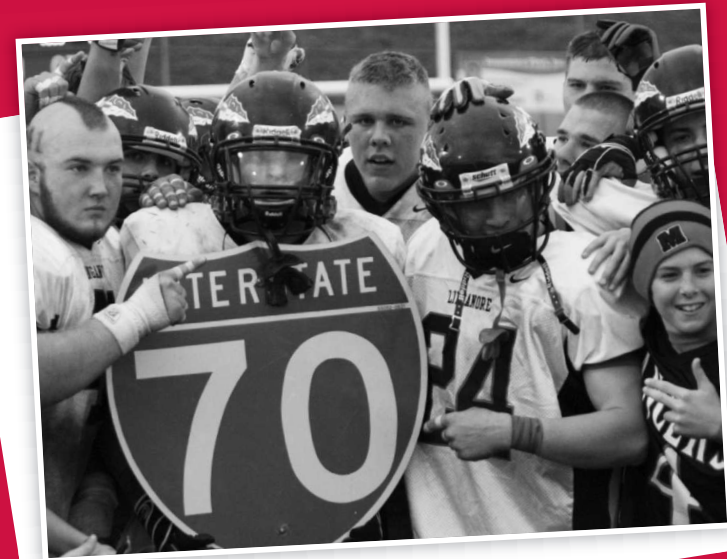
2008 I-70 Champions